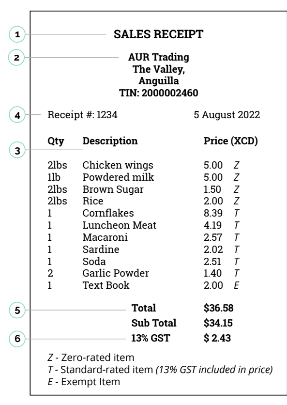
Figure 2: Sample Sales Receipt

A sales receipt must contain the following (Item 2 of Schedule 3 of the GST Act):